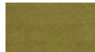
Tramè pistacchio/ Tramè pistachio