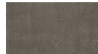
Lino talpa/ Mole linen